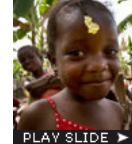
Canada Helping Haiti January 26, 2010

ANNOUNCEMENTS: Obituaries | Births | Cards | InMemoriams | Milestones